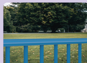
Flat Top Railing