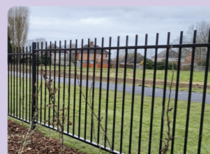
Vertical Tube Railing