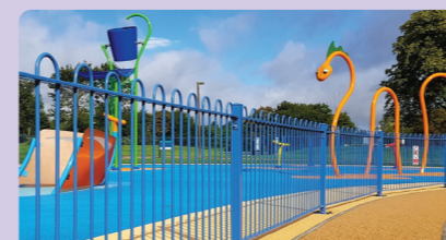
RoSPA Bow Top

AVAILABLE IN 2 FENCE STYLES WITH A FULL RANGE OF GATES TO MATCH: