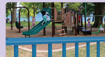
RoSPA Flat Top